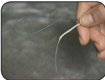
Superfloss showing stiff and fuzzy, tufted segments

Brush and floss your teeth and gums normally after each meal to keep your mouth healthy. Make sure to brush and floss the abutment teeth carefully to keep them strong and healthy.